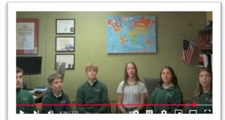
8 th Grade Confirmation